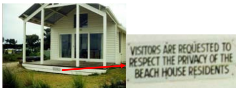
Figure 3: Placement of privacy notice on Laura's Cottage (September 1999)

That this was not a one-off experience was confirmed by the Park Manager, who recounted stories of single women leaving the cottage early due to a strong sense of insecurity. It was at this time that Park Management erected notices that read, "Visitors are requested to respect the privacy of the beach house residents" as illustrated in Figure 3 below.