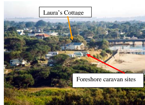
Figure 4: The position of Laura's Cottage in the Barwon Heads Park (September 1999)

management of camping grounds on public land. The increasing number of visitors wishing to view and photograph the cottage and its surrounds was also imposing on campers adjacent to the cottage. Figure 4 shows the context and siting of Laura's Cottage in the caravan park.