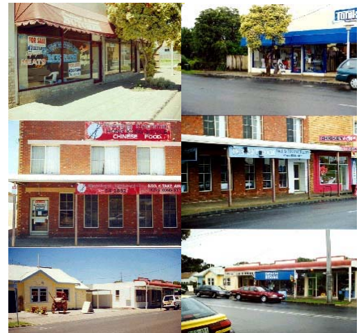
Figure 1: Changes within 12 months of Sea Change (Nov 1998 to Sept 1999): 1. Closed butcher becomes a surf shop; 2. Closed Chinese restaurant becomes an up-market restaurant; 3. Empty new shops now fully occupied by a bookshop, gift shop and café

supermarket shopping residents and visitors to the area were required to travel to the neighbouring town of Ocean Grove, some five kilometres away. These changes to the main street of the town is illustrated in Figure 1.