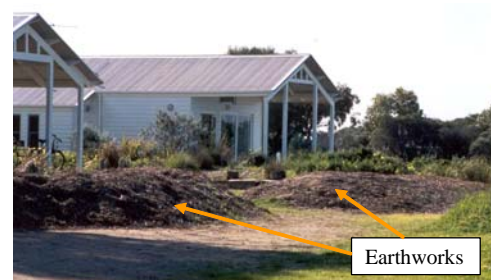
Figure 5: Earthworks developed to keep walkers and sight-seers away from the cottages (September 2001)

By mid 2001, a second cottage had been built next to 'Laura's', with plans to build a third. While the threatened fencing had not happened, earthworks and vegetation plantings were added to discourage people from walking right up to the cottages in order to gain some privacy for guests, as shown in Figure 5. I was not able to test their efficacy personally as the cottages were booked out for over six months in advance.