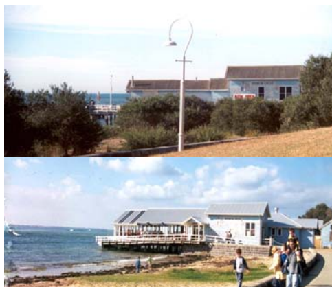
Figure 7: Diver Dan’s shed as used in the first series of Sea Change , originally Fisherman’s Cooperative (April 1999) and the new, initially controversial, restaurant development (July 2001)

The photos of the site in Figure 7 demonstrate the extent of the development and the retention of the shed’s façade which was a region of concern of many protests. The front part of Dan’s shed has been retained and incorporated into the restaurant – it has not been re-painted, rather left with the ‘distressed’ façade that is now so familiar to millions of Australians. These photos show the ‘before and after’ versions of the site development. (The different angle of the shot has excluded the bushes that were in the first one – they are still there!)