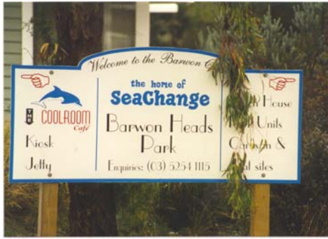
Figure 2: Signage at the entrance to Barwon Heads Park (September 1999)

During an intense period of participant-observation research in Barwon Heads Park, while staying in the cottage used as Laura's residence in the series on a site visit, which is situated in the government-owned and operated camping ground (Barwon Heads Park) with a predominance of caravan and camping sites, so there is no fencing around the cottage. Tourists were continuously taking photos of the cottage, while others ran up onto the veranda to peer through the windows at all times of the day and night. This created a great deal of stress and insecurity, especially at night time, whereas in the past this had never been an issue when I had stayed there, even when being the only resident in the Park.